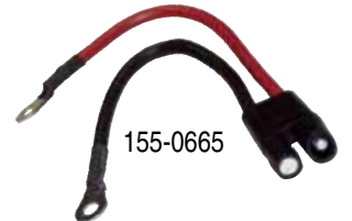
Red Cables to Motor