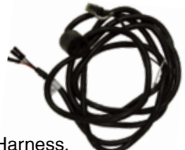
Slick Stick uses 155-0715 Harness.