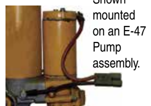
Shown mounted on an E-47 Pump assembly.