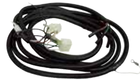
Toggle Lift and Angle Switch uses 155-0630 Harness.